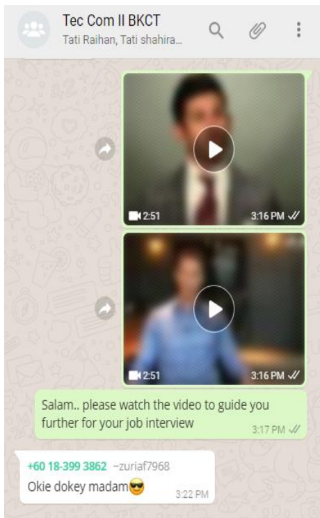
Fig. 3: Print screen of VMWA used in English course